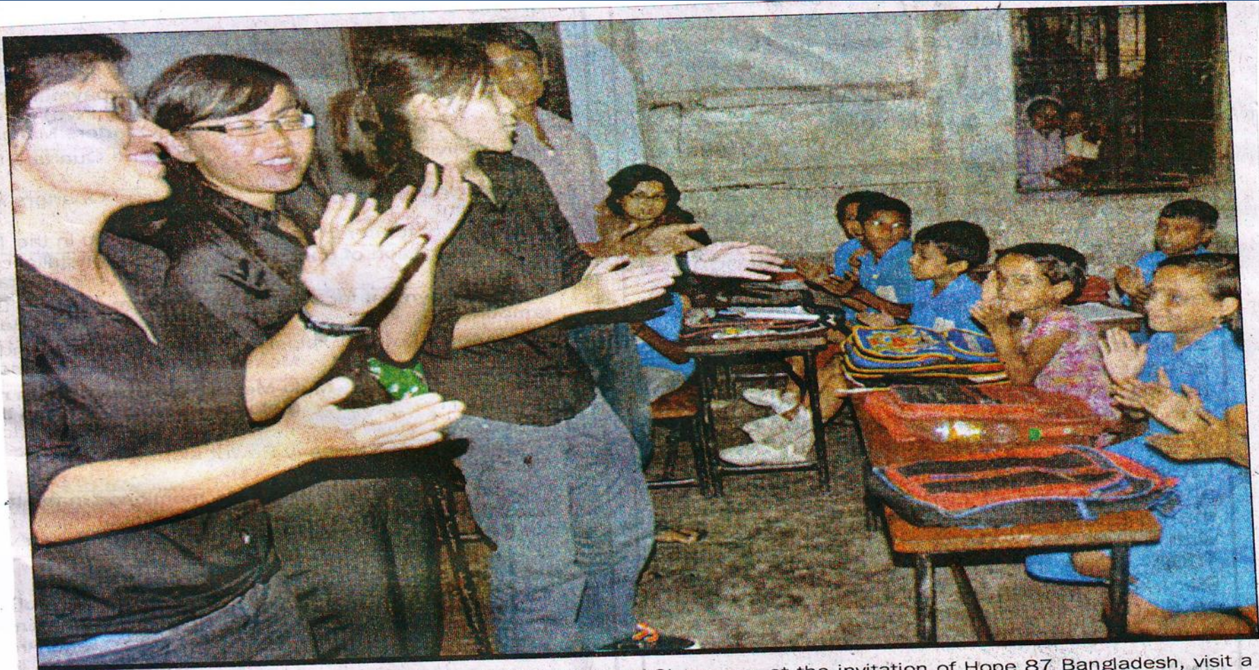
Representatives of People's Association Youth Movement of Singapore, at the invitation of Hope 87 Bangladesh, visit a night school run by Moitri in the Dhaka city on Friday.